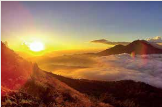
SUNRISE AT MOUNT BATUR