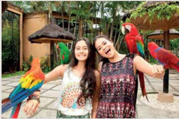
BALI BIRD PARK