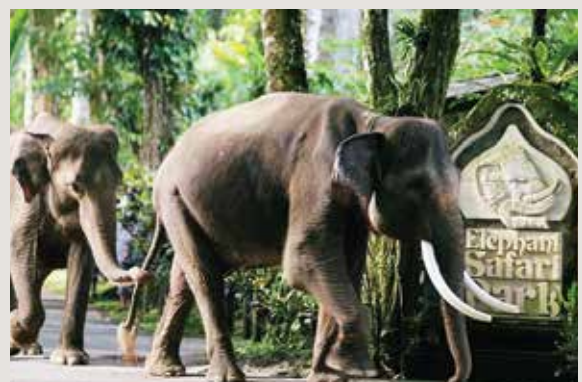
TARO ELEPHANT PARK