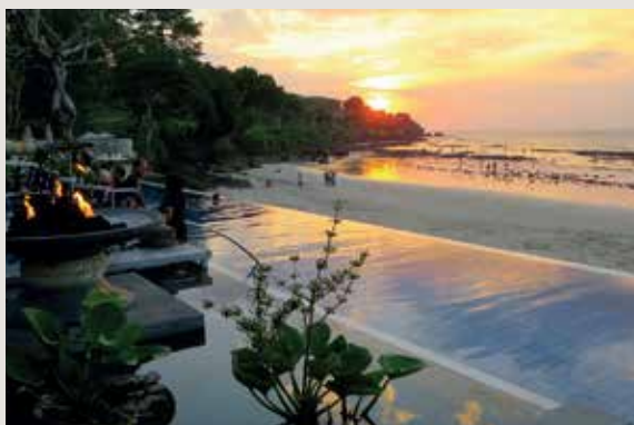
SUNDARA RESTAURANT (FOUR SEASONS HOTEL)