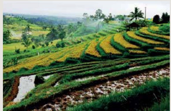
RICE TERRACES (UBUD)