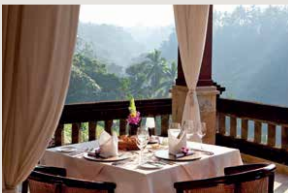
LUNCH IN UBUD CENTER