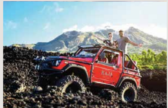
SUNRISE JEEP RIDE