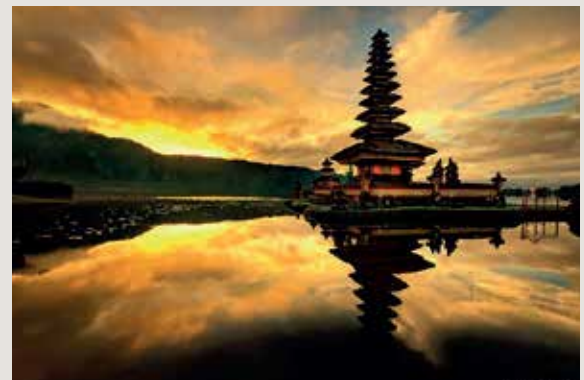
ULUN DANU (SUNSET)