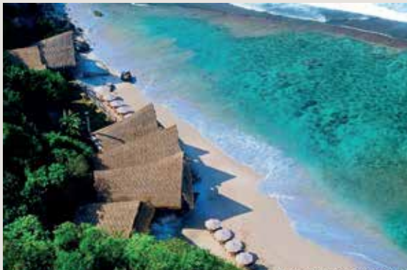
SUNDAY BEACH CLUB

* DRINKS / DINNER IN JIMBARAN BAY AT OWN COST