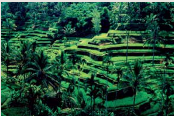
TERRACE RICE FIELDS UBUD