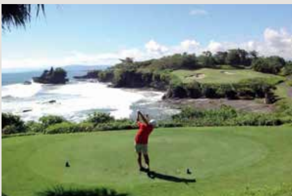
NEW KUTA GOLF