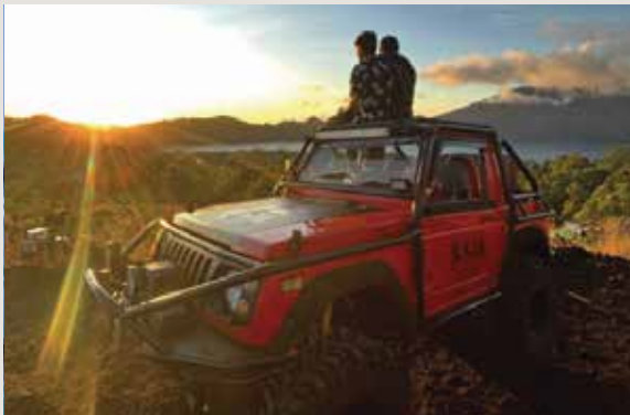
SUNRISE JEEP RIDE

* FEE TO THE TRUNYAN VILLAGE AT OWN COST