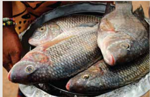
SPECIAL FISH FROM BREAKKY & BINTANG