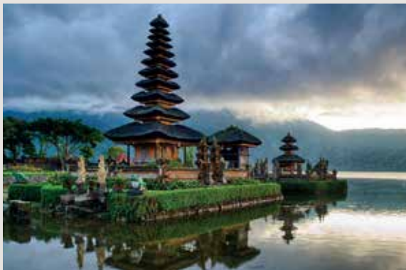
ULUN DANU TEMPLE

* GOLF ENTRY, SHOES AND CLUB HIRE NOT INCLUDED