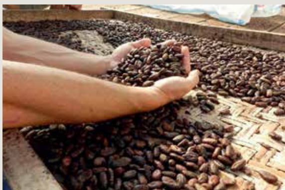
BIG TREE CHOCOLATE FACTORY