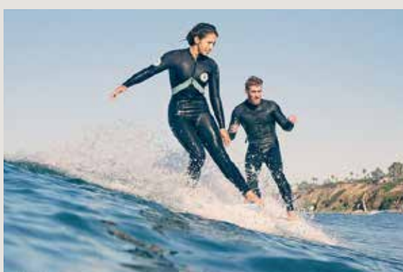
SURF LESSONS IN BLUE OCEAN SEMINYAK