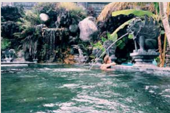
HOT SPRINGS AT BATUR LAKE