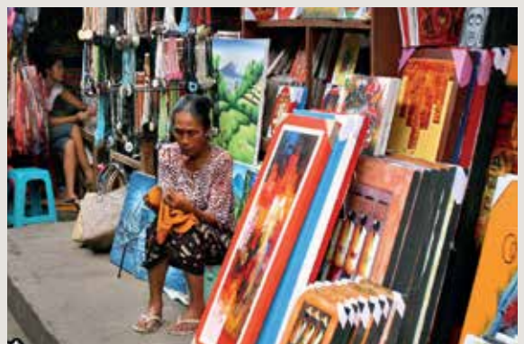
BALINESE ARTISTIC DISTRICTS