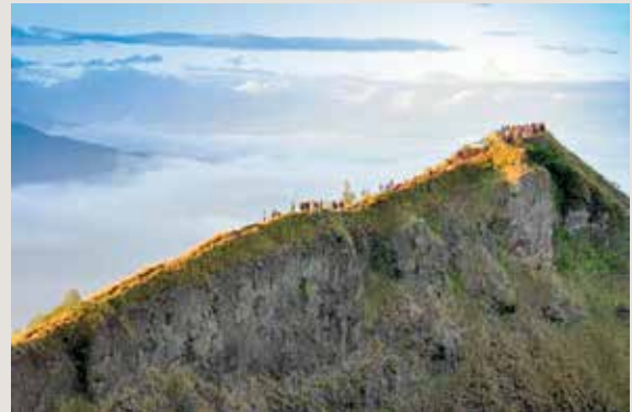
TREKKING MOUNT BATUR