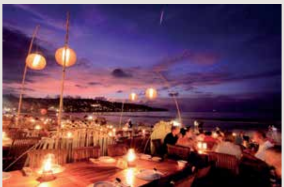
MENEGA CAFE JIMBARAN