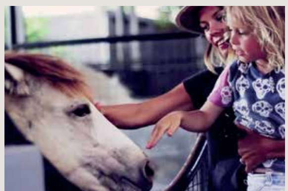
BALI EQUESTERIAN CENTRE