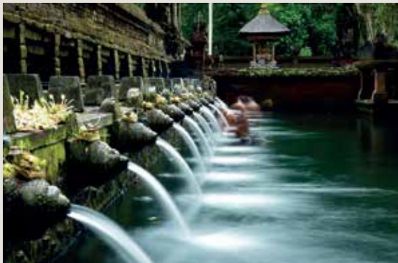
TAMPAK SIRING TEMPLE

* THIS TOUR CAN ALSO BE UBUD FIRST & TEMPLE LAST ( DEPARTURE 10.30 AM )