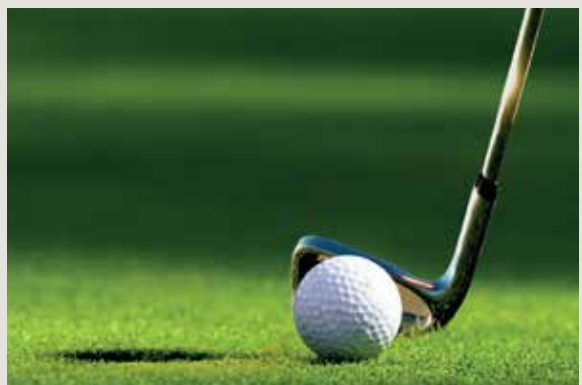
NEW KUTA GOLF